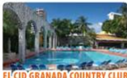
EL CID GRANADA COUNTRY CLUB

★★★★☆ YOU'LL LOVE THE PLEASANT COMFORT OF THIS THREE STOREY, MEXICAN-STYLE HOTEL. BUILT AROUND BEAUTIFUL GARDENS, THE SERENITY AND BEAUTY OF THE SWIMMING POOL ARE UNIQUE.