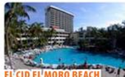
EL CID EL MORO BEACH

★★★★★ EL CID EL MORO BEACH IS NESTLED IN THE EXCITING HEART OF MAZATLAN'S GOLDEN ZONE. A FEW SANDY STEPS FROM ECCLECTIC RESTAURANTS, BUSTLING NIGHTLIFE, AND DIVERSE SHOPPING, SWIM IN TWO LARGE POOLS FEATURING CASCADES, CAVES, ROCK FORMATIONS, SWIM-UP BARS AND SNACK AREAS, AND WATER SLIDES.