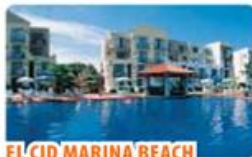
EL CID MARINA BEACH

★★★★★ EL CID MARINA BEACH HOTEL TRULY OFFERS THE BEST OF BOTH WORLDS. ONLY MINUTES FROM THE COLORFUL FESTIVALS, ATTRACTIONS, AND RESTAURANTS OF THE GOLDEN ZONE.