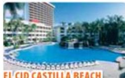
EL CID CASTILLA BEACH

★★★★★ IF YOU ARE LOOKING FOR THE PERFECT VACATION, EL CID CASTILLA BEACH BEACH HOTELS IS PARADISE BY THE SEA. COME AND ENJOY MAZATLAN'S BREATHTAKING SUNSETS FROM THE BALCONY OF YOUR ROOM.